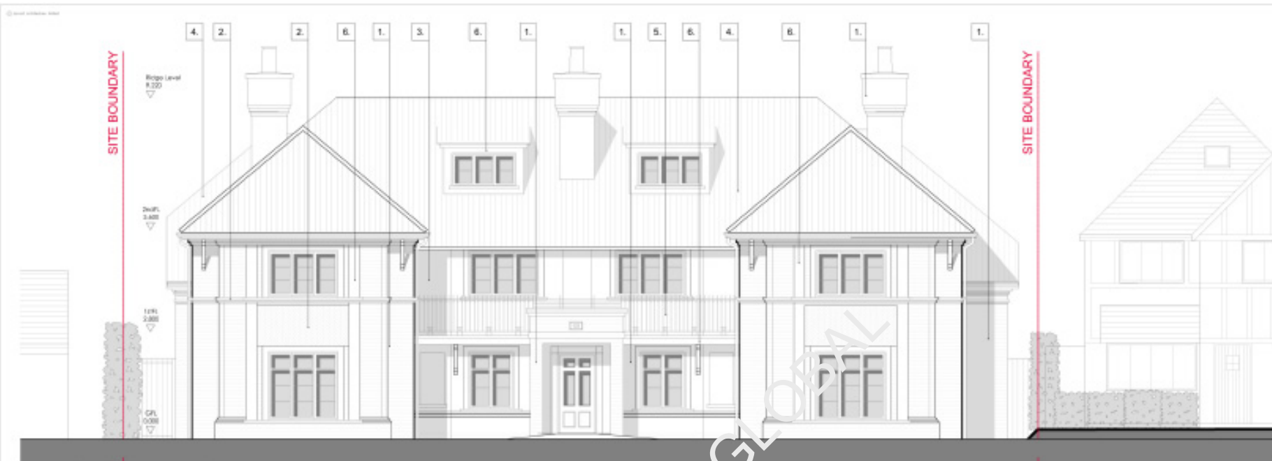
Proposed North West (Front) Elevation